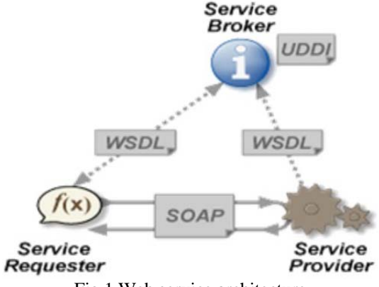
Fig.1 Web service architecture.

Many organizations use multiple software systems for management. Various software systems need to be exchange the data with each other and web service is used for the communicate between two systems or applications over the network. Service requester is request data to software system where system process the request and provide the data called service. Using different language software might be developed and however there is need a method to exchange data efficiently that doesn't depend on that particular programming language. Most of the software use XML tags. However by using XML tags web service can exchange the data. The web service architecture can be described as below in fig 1.and define work of service broker, service provider and service requester. Web service discrimination language file (WSDL) can be send to Universal description, discovery and integration (UDDI) by service provider. If the requester need data then he contact with UDDI for the find out who is provider and by using SOAP (Simple object Access Protocol) Protocol requester can contact with service provider. Then the service provider validate the request and process request and send it is an XML file using the SOAP (Simple Object Access Protocol) protocol. This XML file would be validated again by the service requester using an XSD file.